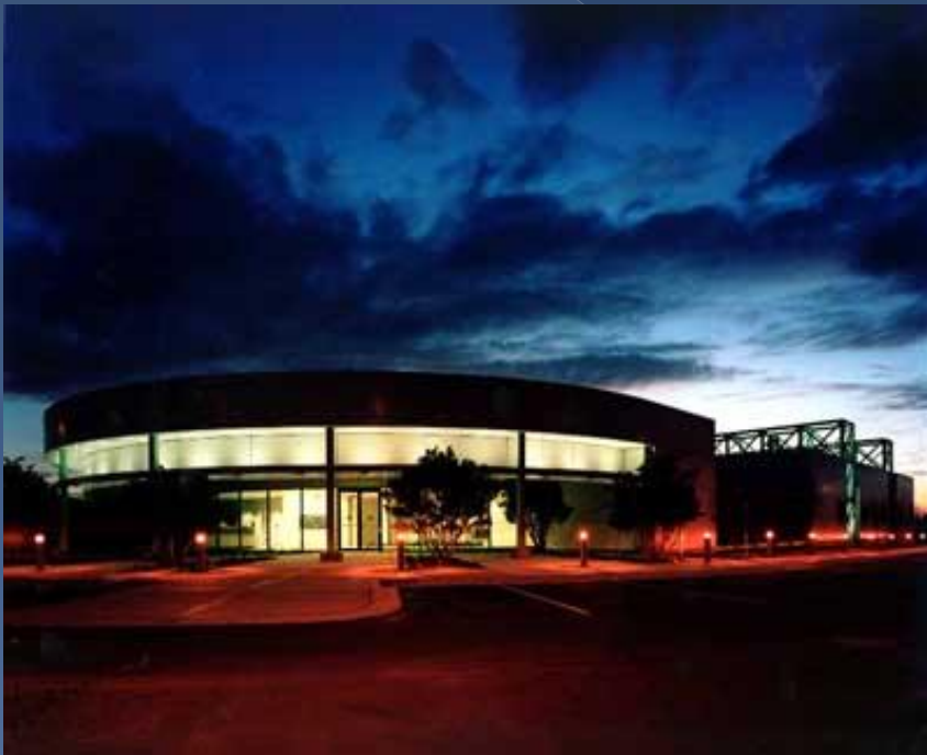
Photo: Sid Martin Bio-tech Center, University of Florida has generated dozens of new companies via tech transfer and incubator services

Indicators: type and volume of product/service sales outside the home area; innovation capacity with measures of training, technology transfer and usage, numbers of patents